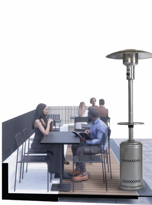
No Roof + Propane Heaters (Requires proper propane tank storage)