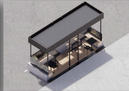
"Orchard" Parklet (Roof)