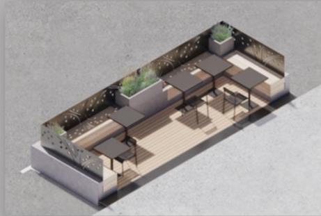
"Orchard" Parklet (No Roof)