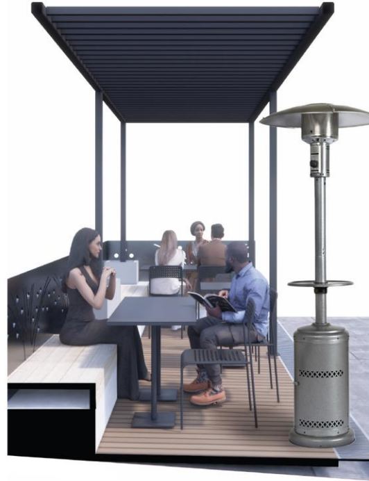
With Roof + Propane Heaters (Requires proper propane tank storage)