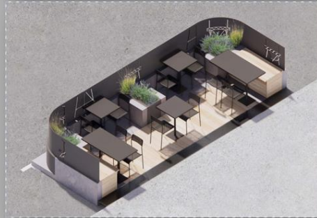
"Water Tower" Parklet (No Roof)